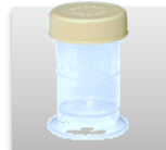
Cup for colostrum