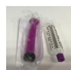
Plungerless capped syringe