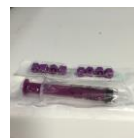
Syringes and caps